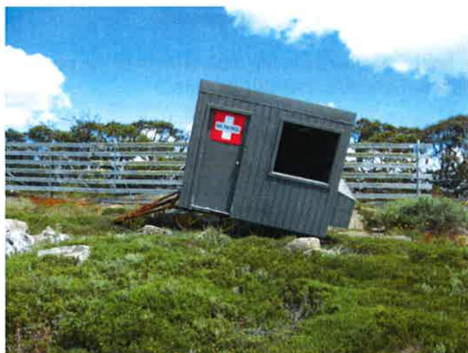
Photograph 3: The existing ski patrol hut on sleds.

The proposed hut is the typical green/grey in colour, and is 3.12 metres long, 2.43 metres wide and 2.63 metres high (see Photograph 3).