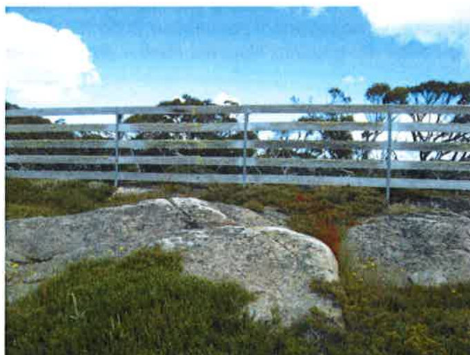
Photograph 1: View downslope of the Lower Rollercoaster ski run.

The works are proposed at the top of the Interceptor chairlift, to the north of the top station, midway along the existing snowfence.