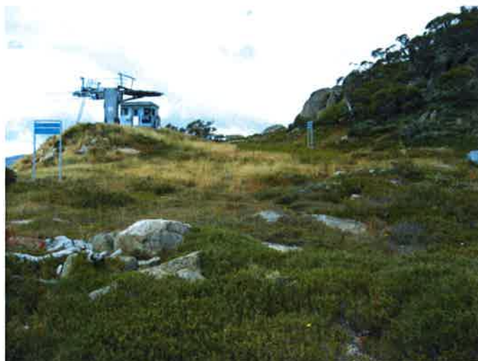
Photograph 2: View looking south towards the top station of the Interceptor chairlift from the proposed location of the hut.

The area either side of the snow fences comprises of large rocks with heath vegetation (see Photograph 1). There is an existing access track immediately to the east of this snow fence and rocky vegetated area.